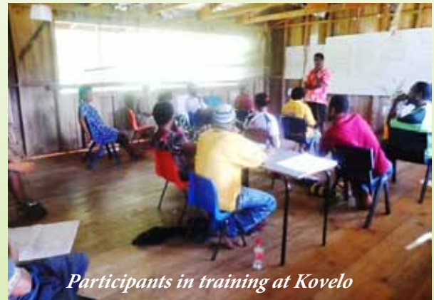
Participants in training at Kovel

A more practical aspect of the training for the mentors were resource mapping and business need identification and pulling on practical approach to