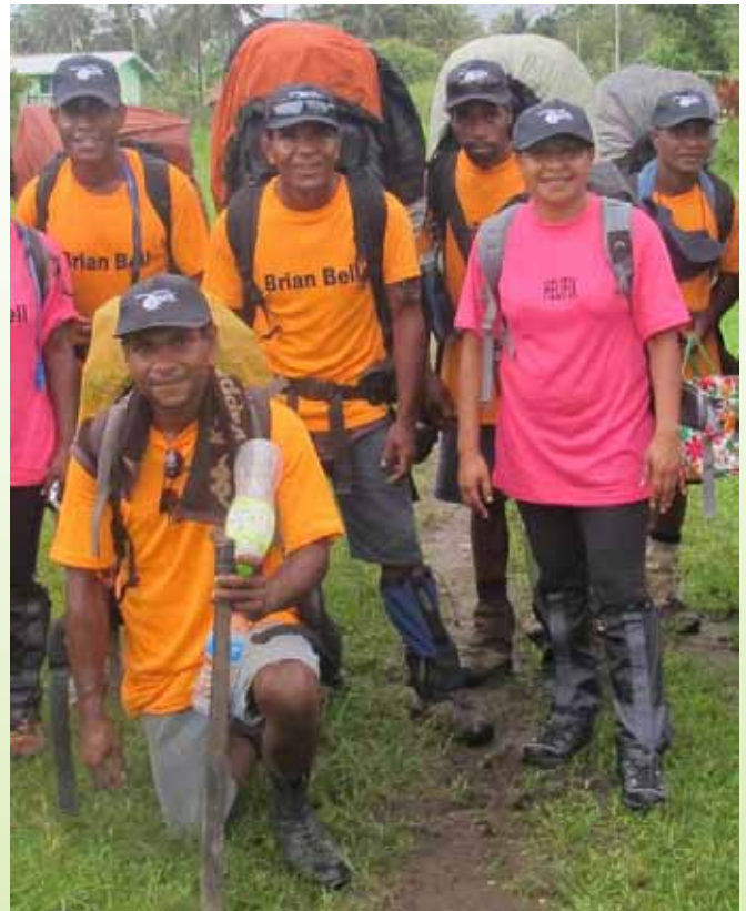
Team Buna Trek & Tours

“WHEN YOU WALK KOKODA TRACK WITH BUNA TREKS & TOURS YOU SUPPORT A 100% PNG OWNED BUSINESS”