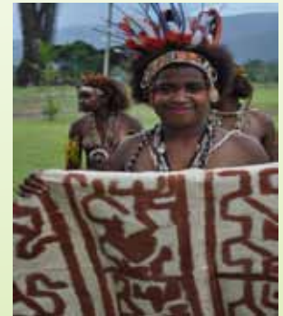
Kokoda Culture: The Oro Tapa is a significant identity of the people of Oro

Purposes Authority of the Kokoda and Koiari Local -level Governments we have and will continue to safe keep and manage the Kokoda Track and its culture so the world must know the history, the values and the importance of this place.